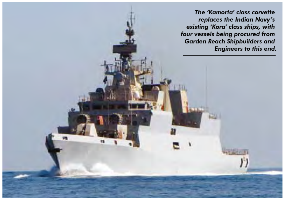
The ‘Kamorta’ class corvette replaces the Indian Navy’s existing ‘Kora’ class ships, with four vessels being procured from Garden Reach Shipbuilders and Engineers to this end.