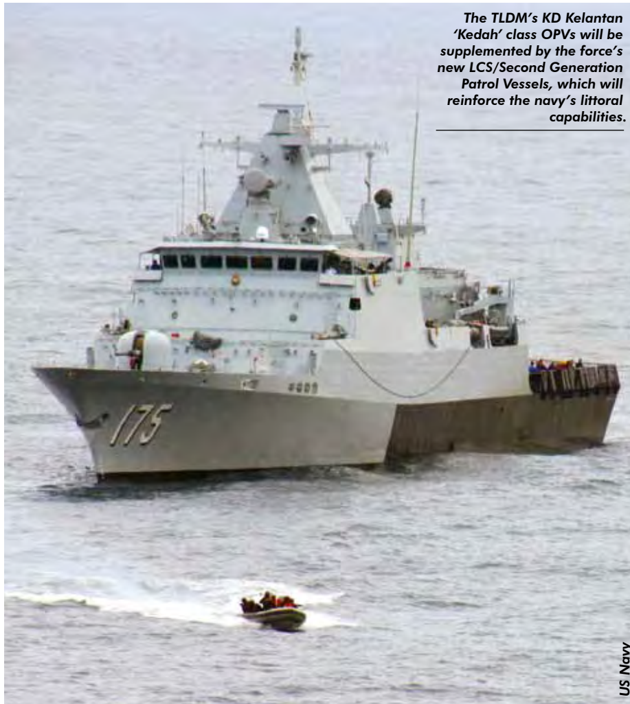
The TLDM's KD Kelantan 'Kedah' class OPVs will be supplemented by the force's new LCS/Second Generation Patrol Vessels, which will reinforce the navy's littoral capabilities.

Revati naval surveillance radar and an IAI ELTA Systems EL/M-2221 fire control radar. According to recent local press reports, the Indian Navy will receive a total of four vessels. The first example, the INS Kamorta commissioned in August 2014, and was followed by the INS Kadmatt in January. The INS Kiltan should commission in September with the INS Kavaratti following by the end of 2017.