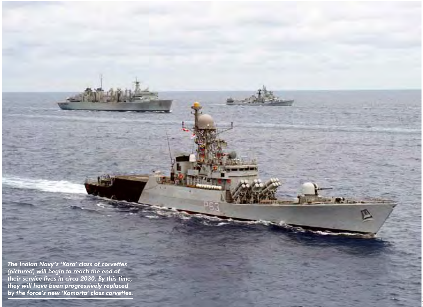
The Indian Navy's 'Kora' class of corvettes (pictured) will begin to reach the end of their service lives in circa 2030. By this time, they will have been progressively replaced by the force's new 'Kamorta' class corvettes.