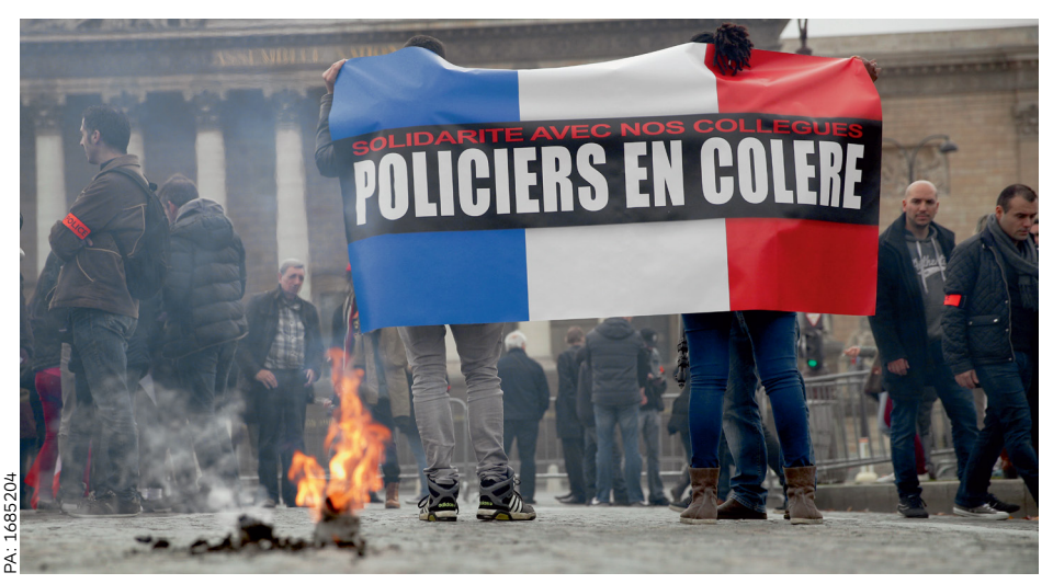
Police officers protest outside the National Assembly in Paris, France, on 26 October. Their concerns centred on a lack of equipment and rising anti-police violence across the country.

lack of personnel that all the FSI are currently suffering from." The source continued, "While the new plan may respond to operational needs on paper, the state of emergency has increased the number of tasks required of the police force, while on the other hand we struggle to recruit and retain new personnel." The police protests in Paris and other French cities that began on 18 October are an indicator of this general fatigue.