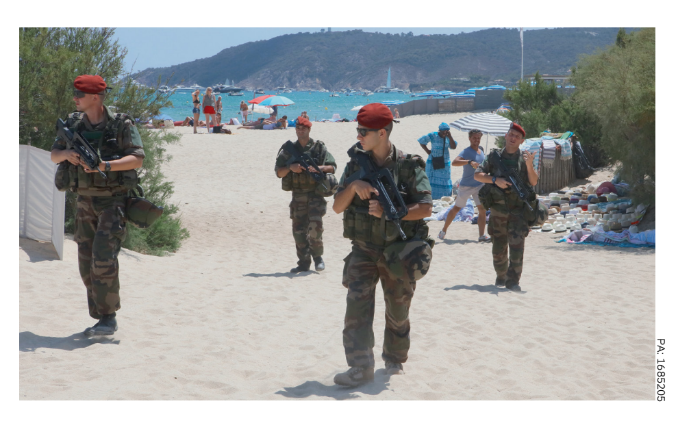
French paratroopers patrol Pampelonne beach near Saint Tropez, France, on 31 July after a further series of terrorist attacks hit the country. The National Intervention Plan enables all units to respond in a crisis and does not require regular units to stand off from terrorist attacks.

Changes to the National Intervention Plan will no doubt bear fruit in the event of other terrorist attacks, prioritising early intervention and therefore saving more lives. However, it appears that greater efforts will still be needed within the Ministry of the Interior to support the various elements of the FSI,